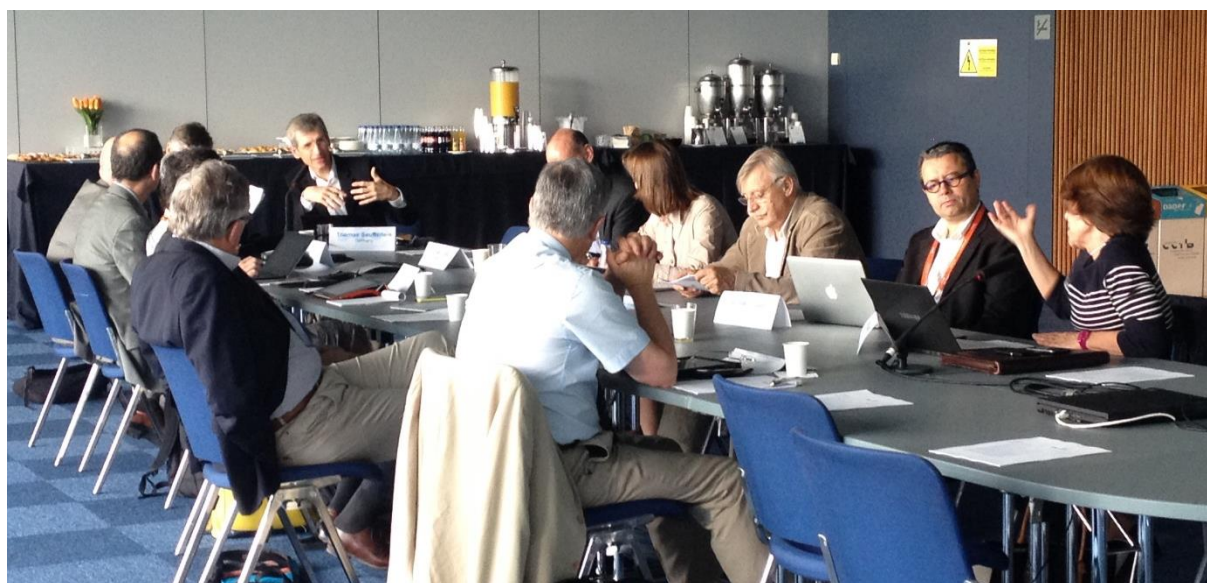
Impression from the ESDO-ESMO Expert Discussion on GE Junction Tumors, held on June 25 from 08:00 to 12:00 at the CCIB, room 120-121.