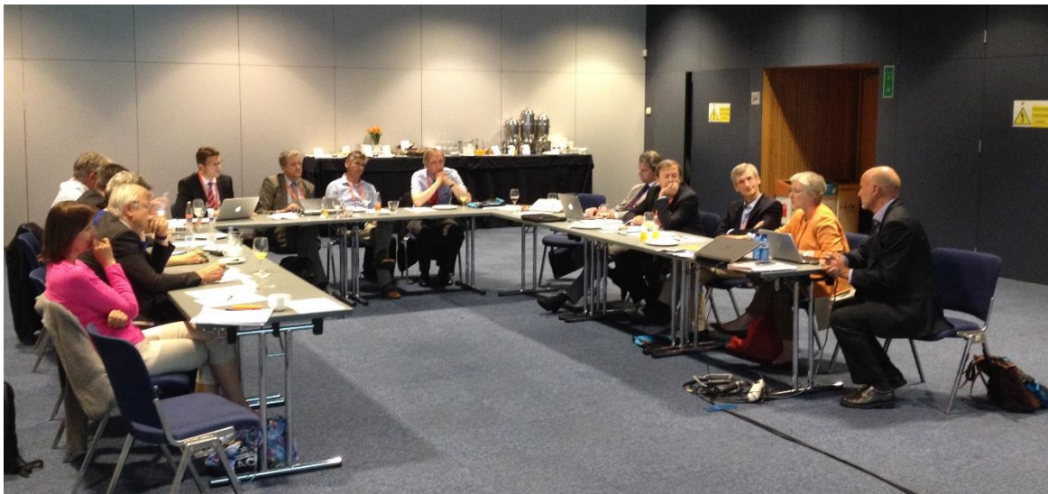
Impression from the ESDO Governing Board & Advisory Council Meeting held on June 26 at the CCIB

All ESDO Members are invited to send us their ideas, thoughts and feedback on ESDO at any time. Your voice is important to us!